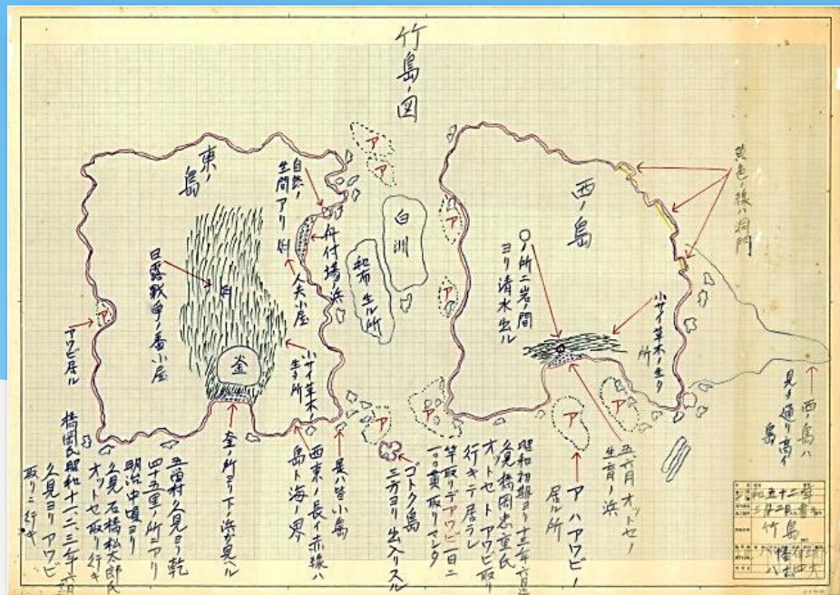
[Map of Takeshima]